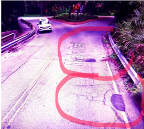
July 2019 Google Maps