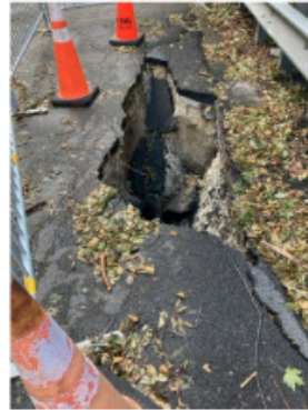
Oct. 10-11, 2024 "the Hole"